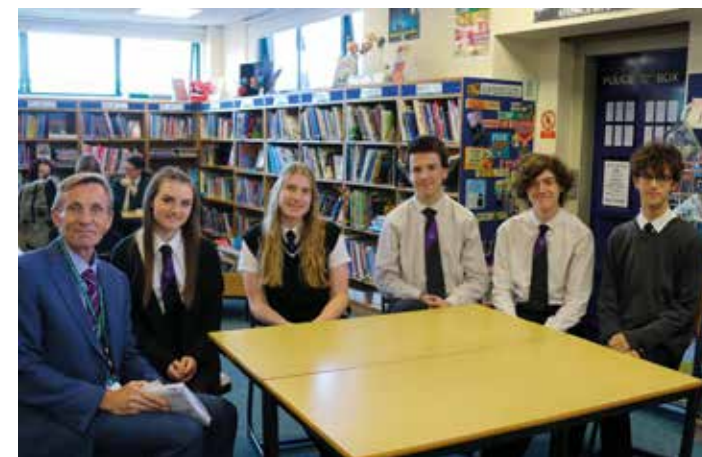
Sixth Form student council meetings