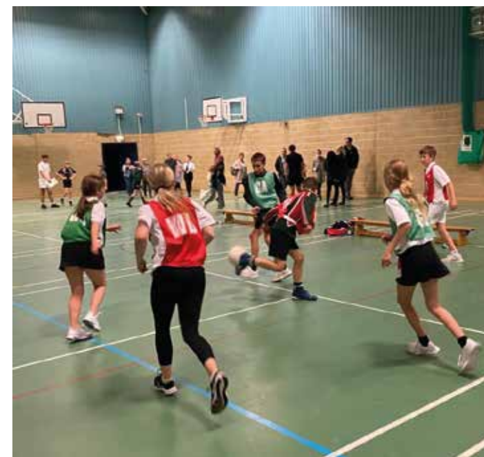
PE during last week's open evening