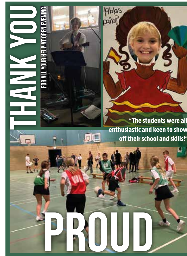
Thank you posters have been put around the school

This has been a week of celebration and excitement. We have received an overwhelming amount of positive feedback from parents regarding the amazing job that (nearly 400) students did in representing the school at the Open events last week. The sixth form senior prefects have started their work in supporting students in Y7-9 – we are very grateful for the time and energy they have already and continue to invest in our school community. We have had some impressive results, and attendance at our sports clubs, fixtures and wider enrichment offer. We are looking at options to try and make attendance at these opportunities even easier for students and will share more information later in the term. We know how important it is for students to have the chance to play, create and work with their friends to helping them feel a strong sense of belonging and pride in their school, so we have pulled together a growing programme of additional activities for them to enjoy. Please see (attached) the extra-curricular programme for the coming weeks – please get involved!